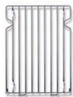
Oven Grid Shelf

AGA Essentials A set of accessories, toaster, roasting tins with grill racks, oven shelves, plain shelf, wire brush and The AGA Book, are all included with your new AGA.